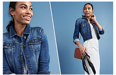
Optimize Your Stitch Fix: 10 Ways to Make Your Closet Awesome