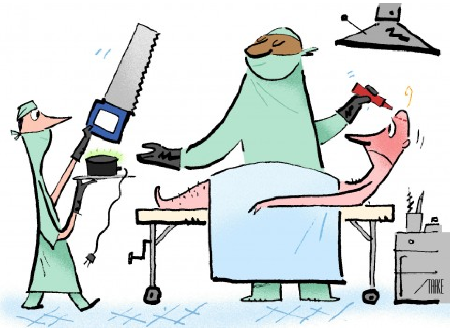
Installing Alexa, the "new interior secretary." See our perennial Mess With Our Heads contest below this week's results.

Plus new for Week 1218: Our perennial 'Mess With Our Heads' bank-head contest