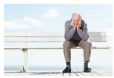
You Do Not Want to Live in These States When You Retire