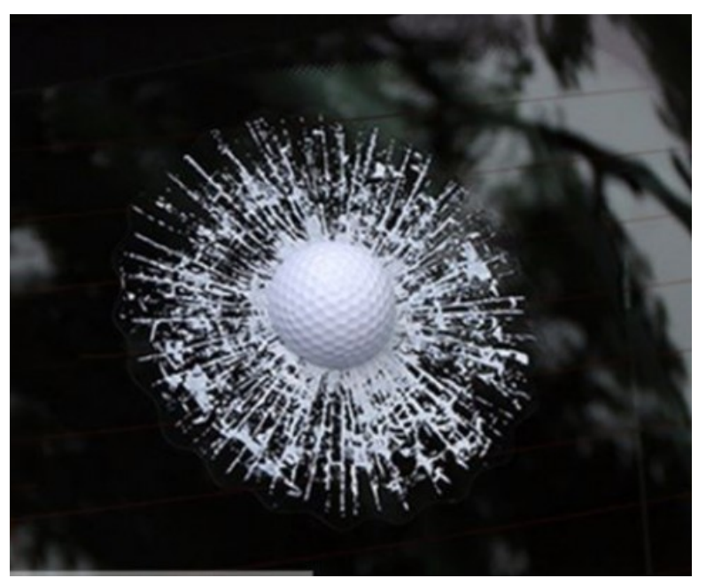
Stick this decal to your car window and you'll at least LOOK like a Loser.