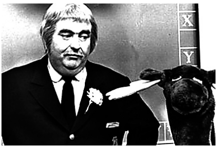
Only 1 in 10 People Can Identify These TV Shows from One Screenshot. Can You?